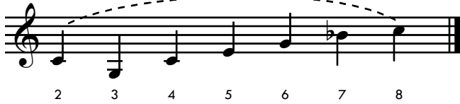
Exercise No. 12a (Overtone Series)